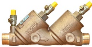
Sizes 20mm - 50mm